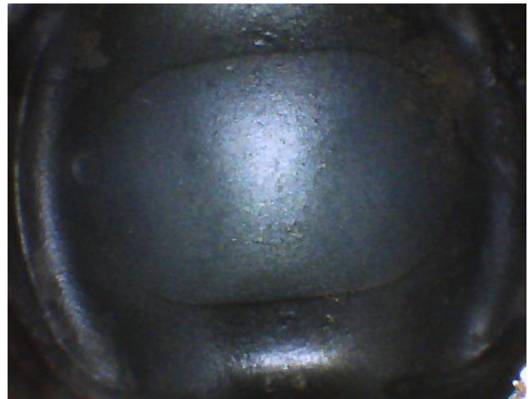
After Cylinder 2