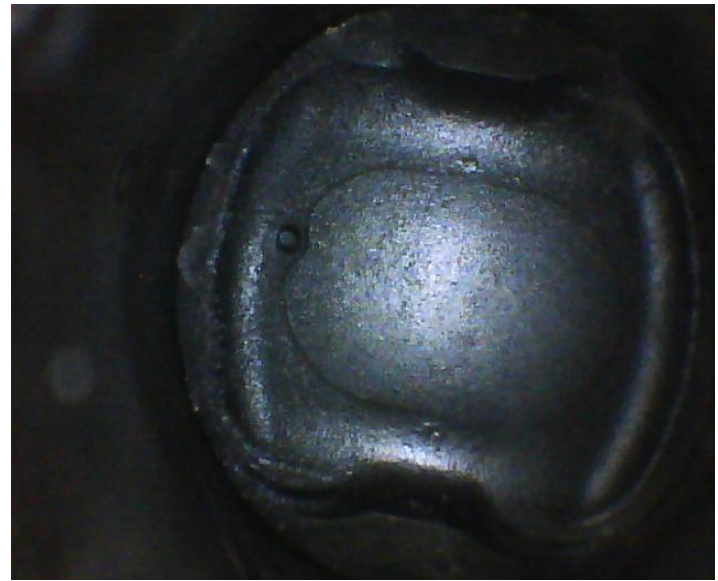
After Cylinder 1