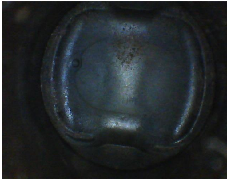
Before Cylinder 1