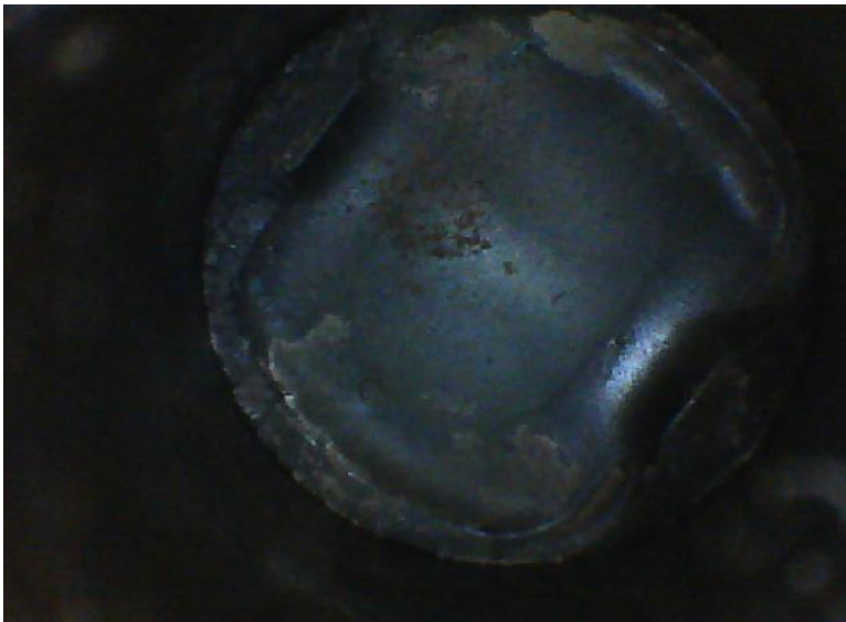
Before Cylinder 4