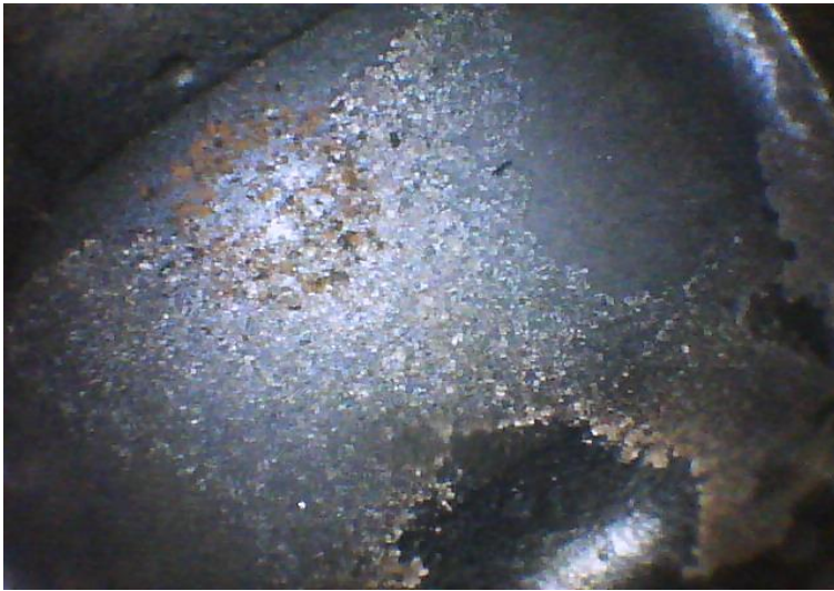
Before Cylinder 3