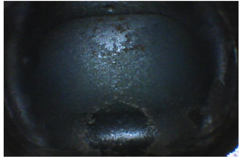
After Cylinder 3