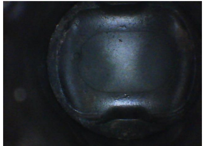
After Cylinder 4